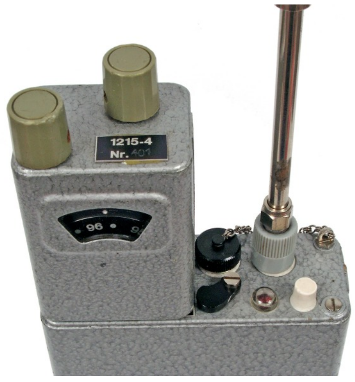
Top view of 31215-1 main receiver body and 31215-4 plug-in remote control unit. (above)

General view of 31215 receiver with battery cassette (in front of receiver) and a 12V vehicle battery adapter (below).