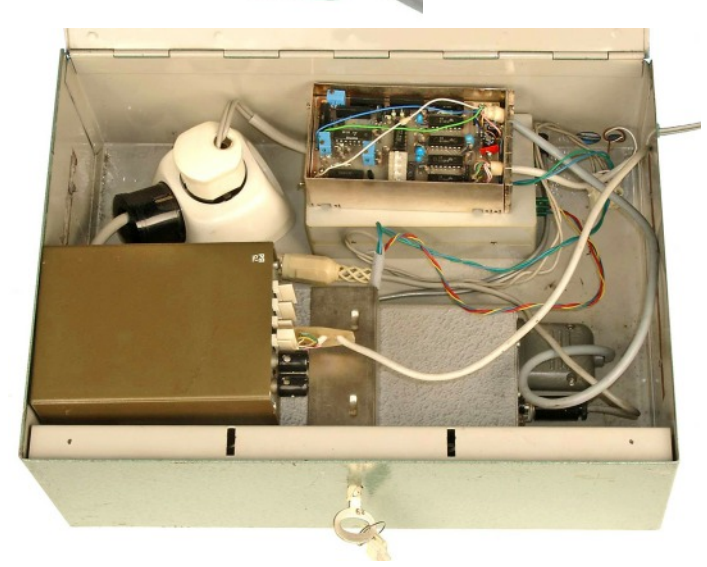
31215 receiver main body with interface unit and remote control equipment 31227 (local unit shown left on top of the receiver body), built into a metal cash box. The control line was connected to a standard telephone subscriber line. See also Chapter 125.